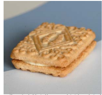
It's a miracle it lasted long enough to take a photo of

Crumbs! The humble Custard Cream has been voted Britain's favourite biscuit thanks to being "fun" to eat and a good dunker.